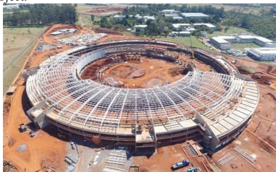
Figure 1: Sirius' construction status in August, 2016.

Currently under construction, Sirius is a 3 GeV, fourth generation synchrotron light source [1]. Sirius is designed to have up to 37 beamlines with ultra-low emittance and high brightness, which will allow high-level research and development on a large range of areas as structural biology, materials science and nanoscience. Development of high-quality technologies is an important point as well (as the Sirius' monochromators and metrology equipment [2]). Figure 1 shows the construction status of the Sirius' project.