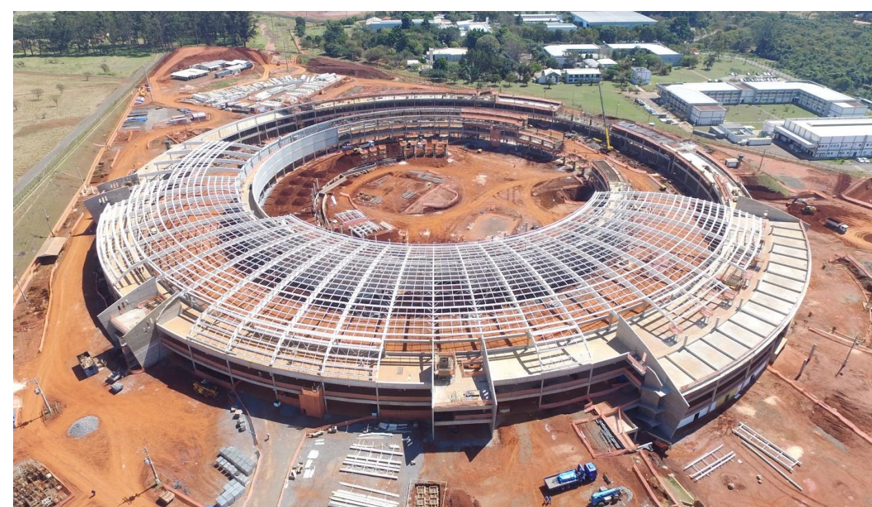
Sirius' construction status in August, 29th.

Currently under construction, Sirius is a 3 GeV, fourth generation synchrotron light source. Sirius is designed to have up to 37 beamlines with ultra-low emittance and high brightness, which will allow high-level research and development on a large range of areas as structural biology, materials science and nanoscience. Given its high quality, its components rely on fine requirements on size, safety and cooling capability, having their design on the state of the art. Taking Front-End power absorbers as example: the refrigeration of these components is complex due to their reduced size allied to the high thermal load that is irradiated on them. To solve this problem, engineered materials must be used. The Glidcop is a good choice due to its good thermal conductivity and preservation of mechanical properties after heating cycles. The difficulty of this project lies on the fact that dissimilar metal components ( i.e. Glidcop and Stainless Steel) must be attached and it is needed to isolate both the vacuum and the water chambers. Thus, the joint must be resistant to hold the pressure in the water chamber and must be tight to not allow the transport of small atmosphere molecules to the vacuum chamber. As a trial to manufacture these components, given its specific features, the brazing was chosen as a joining process.